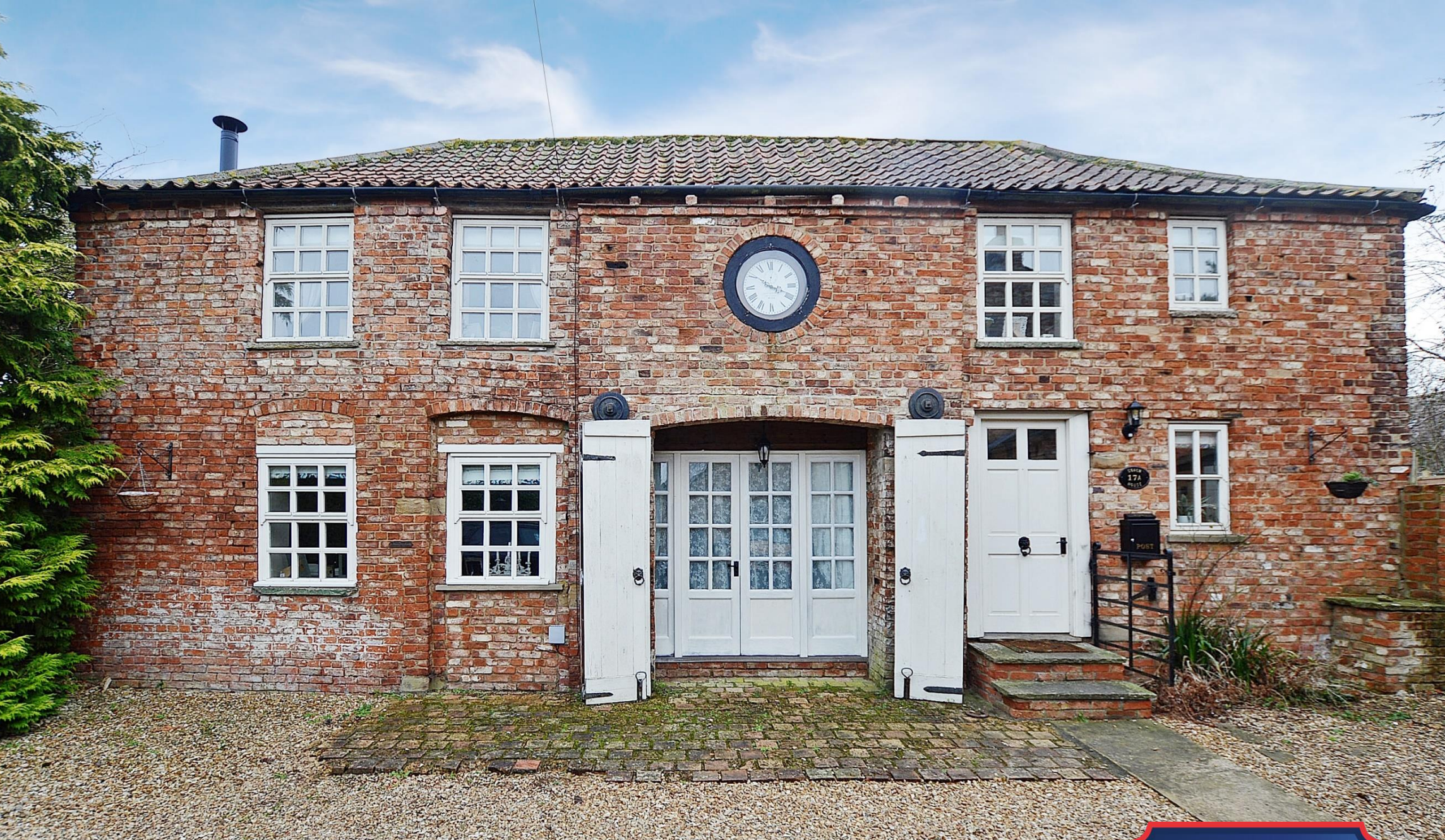
Coach House Timberland, Lincoln, Lincolnshire LN4 3SB